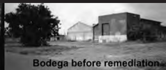
Bodega before remediation