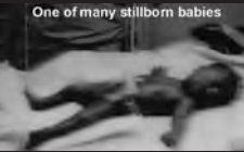
One of many stillborn babies