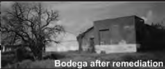
Bodega after remediation